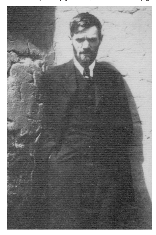
Figure 1. Photo of D.H. Lawrence.

so primitive, so pagan [...] Whenever one is in Italy, either one is conscious of the present, or of the Medieval influences, or of the far, mysterious gods of the early Mediterranean [...] Proserpine, or Pan, or even the strange "[..] gods" of the Etruscans [4].