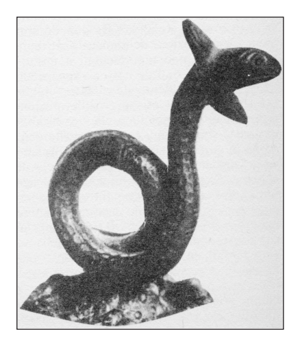
Figure 3. Snake (bronze sculpture).

And looked around like a god [...] [33].